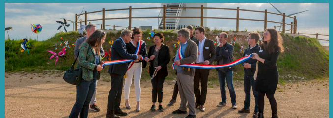
Inauguration of the Sarry wind farm on May 4, 2023

In November 2022, Voltalia signed the largest renewable electricity supply contract ever signed in France. Contracted with Renault Group for a capacity of 350 megawatts, capacity will be gradually increase until full capacity is reached in 2027.