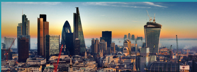
City of London Corporation

Faced with growing electricity needs, Voltalia has significantly strengthened its position in the UK, one of the world's leading renewable energy markets, by commissioning the South Farm solar project. The 49.9-megawatt plant now supplies clean electricity to the City of London Corporation for 15 years under a power purchase agreement. The inauguration will take place on June 16 in London.